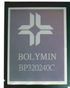
(Options : Frame without ears)